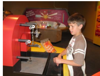
A fourth grade student conducts a science experiment at the Kalamazoo Valley Museum.

94% of the students are proficient in Math according to state MEAP scores.